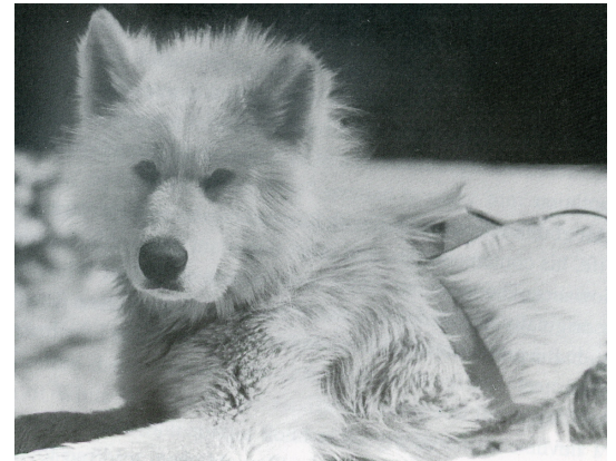
A photo of Rex

Though Rex was not a great dog in the ring, his exploits and physical strength had a profound effect on the breed standard. In his day he was considered to long-legged and was above the height standard for the breed. The height standard for male Samoyeds was subsequently raised 1.5 inches. To this day, the majority of Samoyeds in the United States can be traced genetically to Rex of White Way.